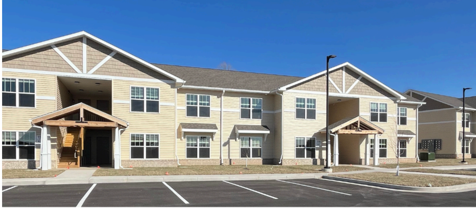
Mountaintop Homes in Mount Vernon, opened June 2025.

Catholic Charities of Southern Missouri’s Housing Program helps individuals and families experiencing housing instability secure and maintain safe, affordable homes. Through individualized case management, resource connection, and housing navigation, our team works alongside clients to address barriers that threaten long-term stability. By focusing on both immediate housing needs and sustainable solutions, the program helps neighbors move toward greater independence, financial security, and lasting housing success.